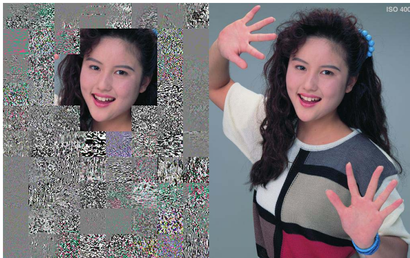
Figure 2 Selected spatial regions are left unencrypted while the remaining regions are encrypted. A JPEG decoder (w/o the key) decodes the left image while a JPSEC decoder with the key recovers the right image.