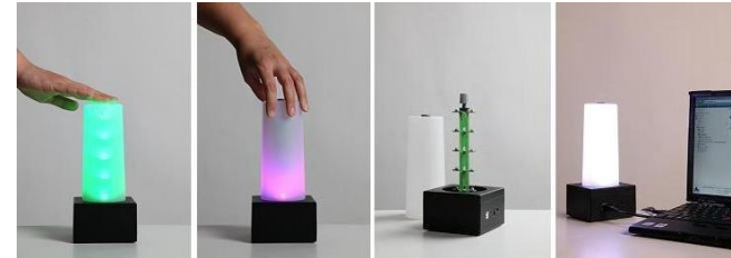
figure 1. Lantern can be controlled by turning and pressing and uses a column of light to indicate its status.

students, which is mostly due to a lack of awareness information, specifically about the availability of TAs and performance of students. Our first awareness tool, Lantern, tries to address this problem.